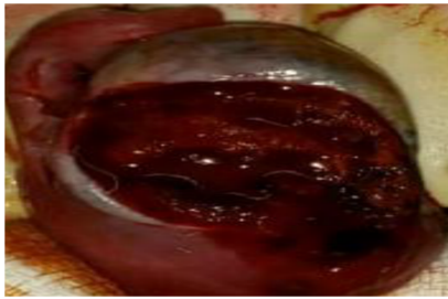
Figure 3. Grade III testicular fracture (AAST).