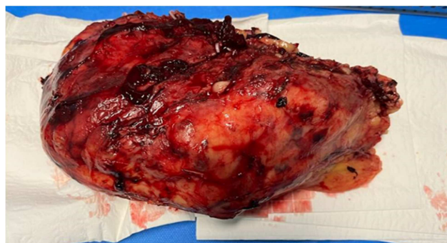
Figure 2. Surgical specimen of an emphysematous NAP of the G. nothing.

After renal drainage and initiation of antibiotic therapy with Cefotaxime and Amikacin. The patient was transferred to intensive care. The patient's hemodynamic and neurological status deteriorated, necessitating intubation. Noradrenaline and hydrocortisone were administered, and Cefotaxime was replaced by Tazocillin. After 48 hours with no improvement, nephrectomy was performed for an emphysematous tumor, destruction of the left kidney and persistence of induced shock. The surgical specimen (Figure 2) was sent to the pathologist, who concluded that the patient was suffering from type II emphysematous pyelonephritis (Wan et al), characterized macroscopically by diffuse infiltration, inflammatory cells (leukocytes) and exudate, abscess formation and necrosis.