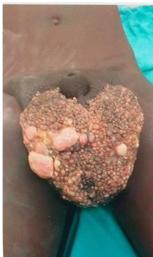
Figure 1. Large genitoscrotal tumor mass of cauliflower-like appearance.

Earlier on, he had consulted in urology for a large, ulcerated scrotal mass without further details. Physical examination revealed a multinodular tumour located at the genitoscrotal region. It had a cauliflower-like budding appearance with marked areas of ulceration (Figure 1).