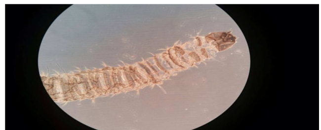
Figure 2. We observed a second larva of Telmatoscopus albipunctata obtained during cystoscopy.