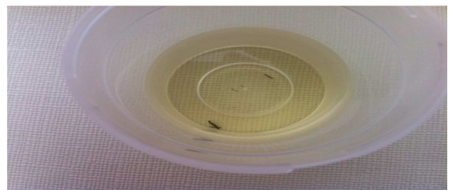
Figure 3. Telmatoscopus albipunctata are observed.