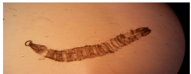
Figure 1. We observe one of the Telmatoscopus albipunctata obtained during cystoscopy.

the second day the urinary catheter was removed, showing abundant larvae; a general examination of normal urine was performed showing macroscopically visible pupae. She was sent to the National Institute Salvador Zubirán where larvae were identified as Clogmia ( Telmatoscopus albipunctata ); Cystoscopy was performed in the operating room, visualizing two larvae; bladder cleaning was performed and biopsies were obtained from the base of the trigone where there were inflammatory changes characterized macroscopically as 1cm red colored maculae. The result of pathology without larva finding was reported with chronic inflammatory changes. An epidemiological screening was done to the family, turning negative; three cycles of Ivermectin treatment were given with an interval of 7 days. All the subjects of the group of explorers were checked without finding another case. The patient recovered completely.