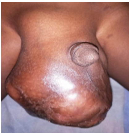
Figure 1. Necrotic and fluctuating right bursa.

After a multidisciplinary consultation meeting, the indication of a polychemotherapy was retained and the patient was sent to a reference center in medical oncology for the rest of the care.