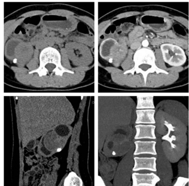
Figure 1. A mixed density Right renal tumor with a size of 7.6 x 7.06 x 6.86cm.

A 14-year-old male with a history of hematuria associated with clots and right flank pain for three months. The abdominal contrast-enhanced CT scan was done, and it demonstrated irregular soft tissue in the right kidney area with a clear border, size: 7.6 x 7.06 x 6.86 cm (Figure 1). A slightly high and low-density tissue necrosis was found inside the Tumor. It reveals an uneven enhancement.