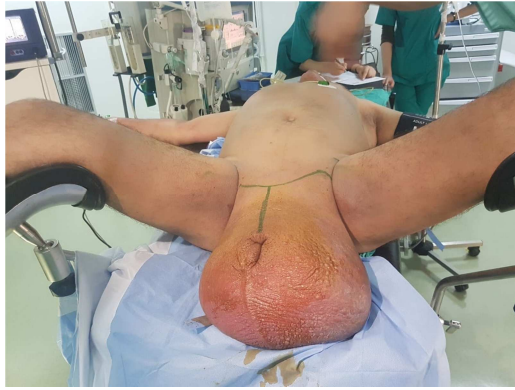
Figure 1. Patient after his installation in the central operating room, after general anesthesia in gynaecological position, we observe a considerable increase in the volume of the bursa with an unsightly appearance making 40-50 cm in diameter with a thickened skin and a penis buried in a glove finger.

The patient was a candidate for surgical management of his pathology after informed consent on the surgical procedure, possible complications, and length of hospitalization.