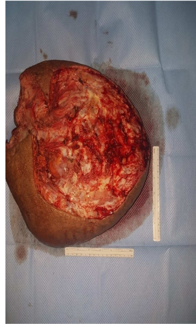
Figure 3. This is the image of the operating room after the extirpability of the mass being 40-50 cm.

The anatomopathological result was in favour of scrotal lymphedema of inflammatory origin.