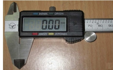
Figure 1. Vernier caliper.

for quantitative variables and were summarized by frequency (percentage) for categorical variables. The correlation of variables was tested by correlation analysis and backward regression analysis was used for prediction penile length and circumference. For the statistical analysis, the statistical software SPSS version 16.0 for windows (SPSS Inc., Chicago, IL, USA) was used. P values of 0.05 or less were considered statistically significant.